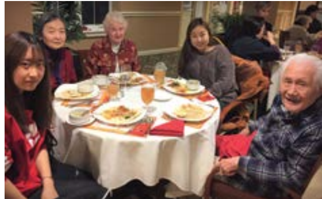
Chinese New Year was a special time for residents at Park Place of Elmhurst to celebrate with Timothy Christian School exchange students.

The meeting was a success. In fact, when students were given the 2-minute warning that their time was almost up, they asked for 5 more minutes!